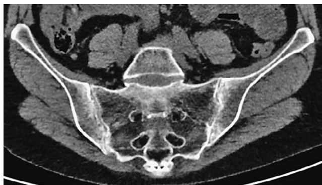
FIGURE 3. Abdominal CT – coronal MPR image showing bilateral grade III sacroiliitis with joint space narrowing, sclerosis and both sacral and iliac bone erosions

SLIKA 3. MSCT abdomena u koronalnom MPR prikazu opisuje, kao usputni nalaz, obostrani sakroileitis trećeg stupnja sa suženjem zglobnog prostora, sklerozacijom zglobnih površina te erozijama na ilijakalnoj i sakralnoj strani zglobova