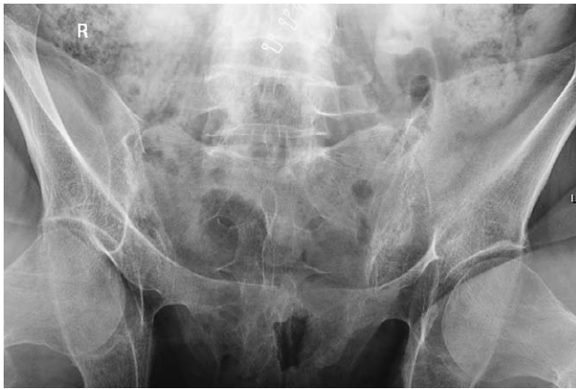
FIGURE 1. Anteroposterior radiograph oblique view of sacroiliac joints showing partial ankylosis of both SI joints defined as grade III sacroiliitis by the New York criteria

SLIKA 1. Rendgenska snimka sakroilijakalnih zglobova po Barshonyju pokazuje parcijalnu ankilozu obaju sakroilijakalnih zglobova koja odgovara trećem stupnju upale prema Njujorškim kriterijima