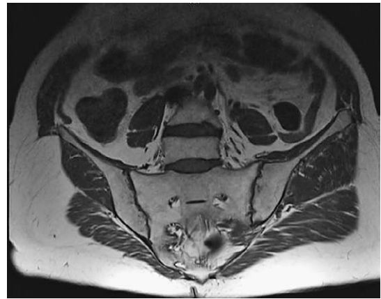
FIGURE 2. MRI of sacroiliac joints – coronal T1 weighted image illustrates narrowing of joint space with partial ankylosis and periarticular fat metaplasia

SLIKA 1. Rendgenska snimka sakroilijakalnih zglobova po Barshonyju pokazuje parcijalnu ankilozu obaju sakroilijakalnih zglobova koja odgovara trećem stupnju upale prema Njujorškim kriterijima